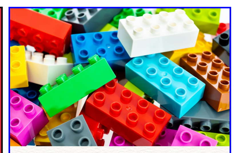
Builder's Club Last Wednesday of Each Month 5-6pm, Ages 6+